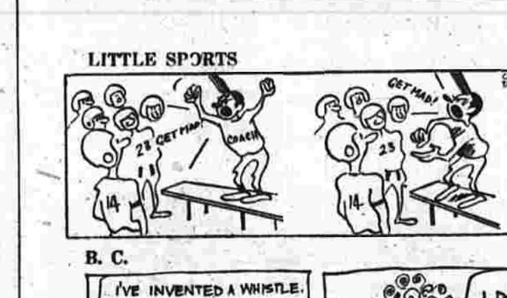
LITTLE SPORTS BY ROUSON