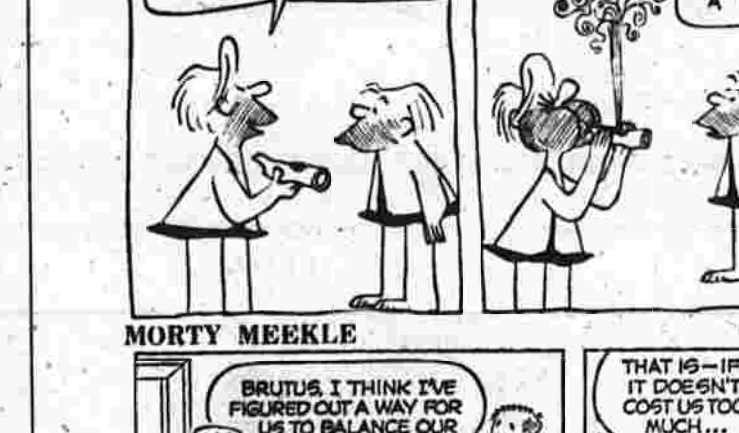
MORTY MEEKLE BY DICK CAVALLI